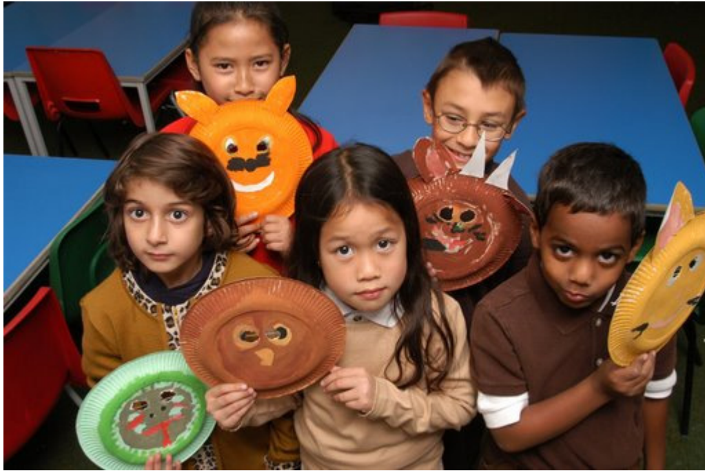
Junior school – making masks, while learning English.