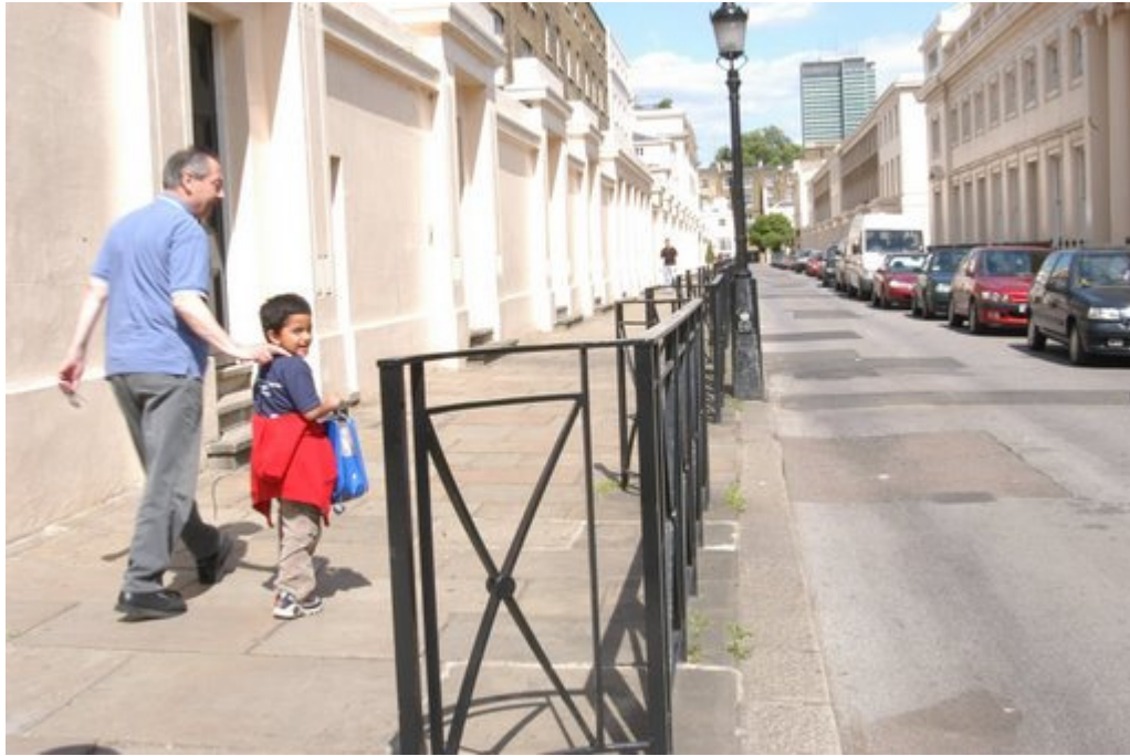
Junior School – outside view from street side