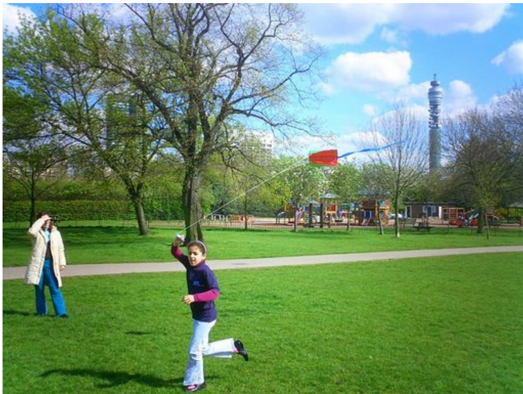
Junior school – playing with kites in Regent's Park.

Weekly Tuition Fees (Juniors 3-17) Year 2010