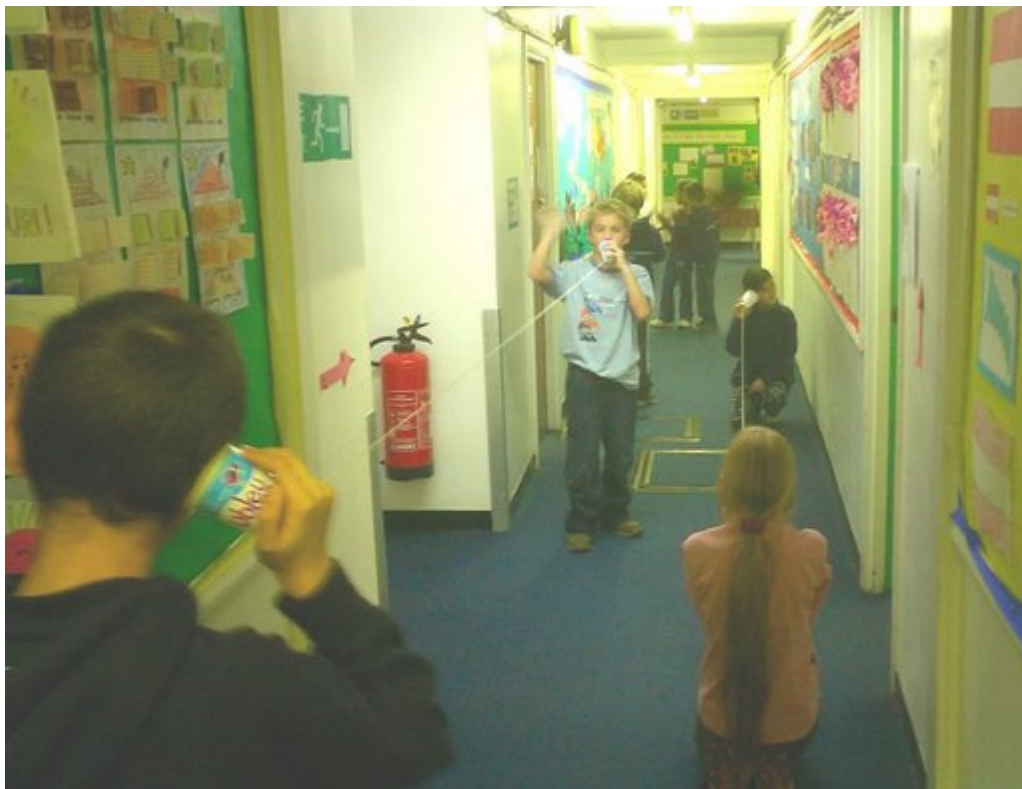
Junior school – science, learning about sound waves, and learning English!